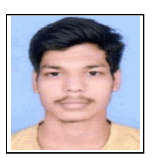
Poddo Gago N